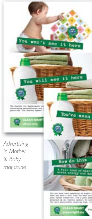
Advertising in Mother & Baby magazine

Stage two was a consumer campaign targeting parents and key concerned consumers throughout the autumn, with online adverts on Netmums and Mumsnet – websites with a combined